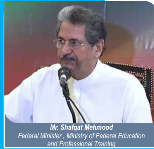
Mr. Shafqat Mahmood Federal Minister, Ministry of Federal Education and Professional Training

embedded with Islamic values. NEAS is playing a vital role in identifying weak and gray areas in our education system across the country through its standardized assessment tools.